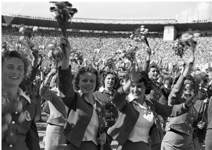
The World Festival of Youth and Students, a tradition started by the Soviet Union in the aftermath of the Second World War.